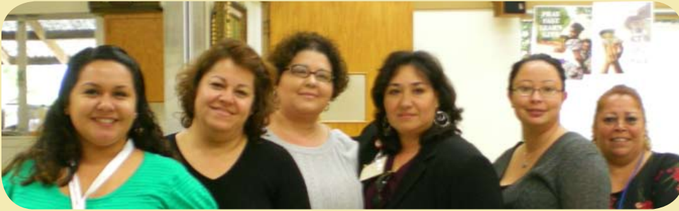
The 2008 Promotoras.